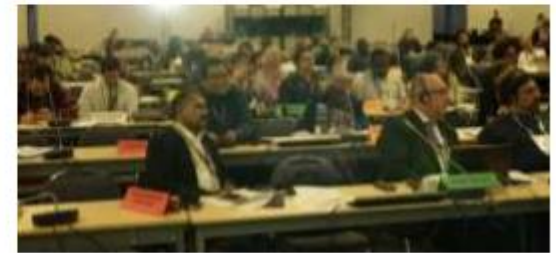
ATLAS III, Montreal